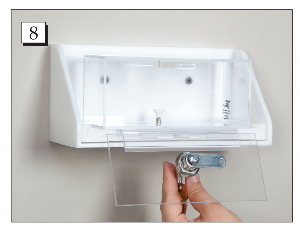
Step 8. Unlock the box.