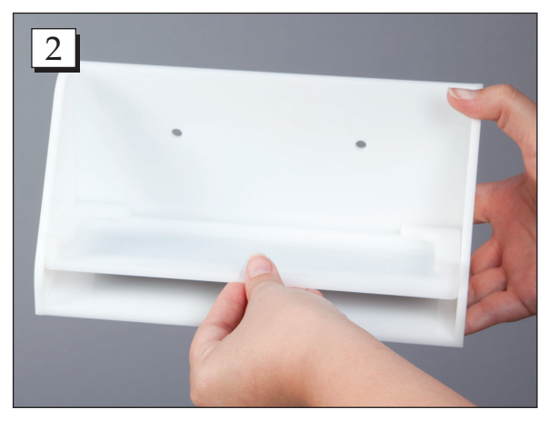
Step 2. Place the Receiving Base in the Wall Mount or on countertop, cart top or shelves.