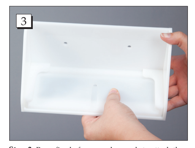
Step 3. Press firmly for several seconds to attach the Receiving Base.