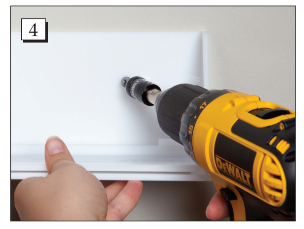
Step 4. Loosely drive the screw into the desired location on the wall or cabinet. (Screws are not provided.)

Call Free 1.800.848.1633 • Fax Free 1.800.447.2923