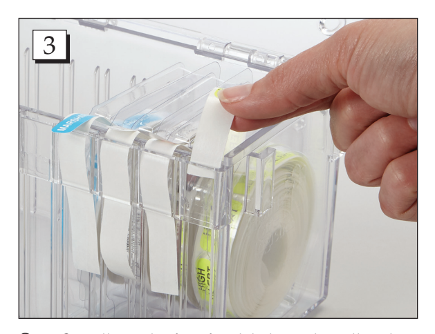
Step 3. Pull out the first few labels on the roll and slide them down into the label guide on the front of the dispenser. (The first couple labels will need peeled by hand.)