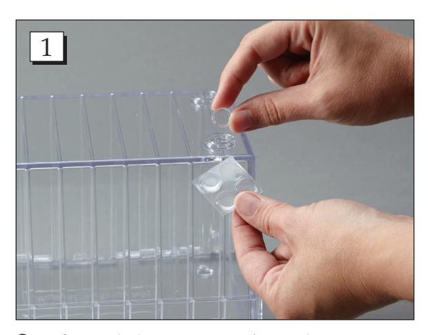
Step 1. Attach the 4 protective feet to the bottom corners.