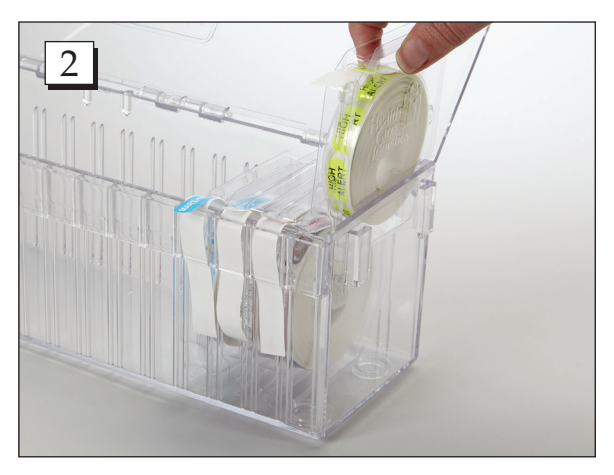
Step 2. Insert the blister pack or open roll of labels into a compartment.