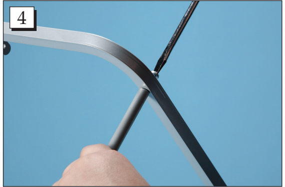
Step 4. Use a flat head screw driver to tighten the rail in place.