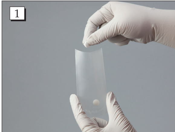
Step 1. Place tablet(s) in the tablet crusher pouch.