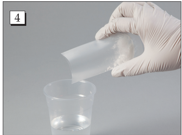
Step 4. Crushed tablet(s) are ready to be administered from the tablet crusher pouch.