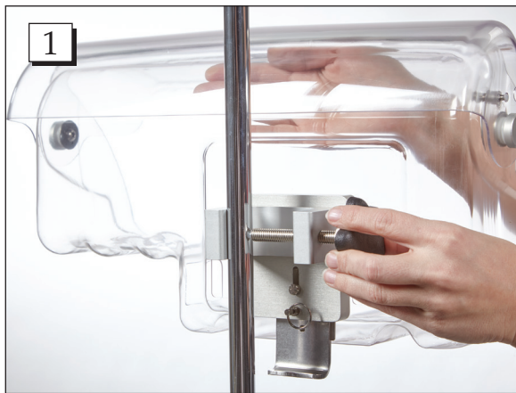
Step 1. Mount the cover to your IV pole.