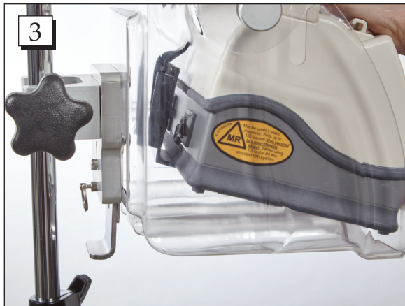
Step 3. Tilt the pump slightly towards you when inserting into the locking mount.