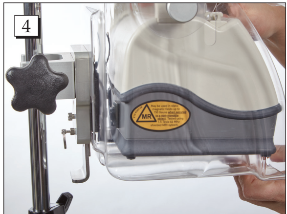
Step 4. Roll the pump into place. Note: When properly seated the pump cannot be lifted out of the locking mount.

Call Free 1.800.848.1633 • Fax Free 1.800.447.2923 Web: GoHCL.com • Email: hcl@GoHCL.com