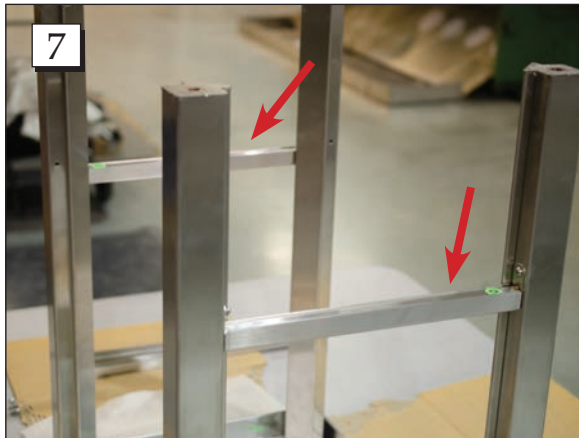
Step 7. Repeat steps 5-6 on the other short support bar marked "D".