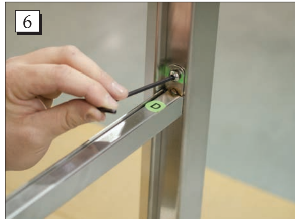
Step 6. Secure each side of the short support bar with a button head screw. Tighten the button head screws with the provided Allen wrench.