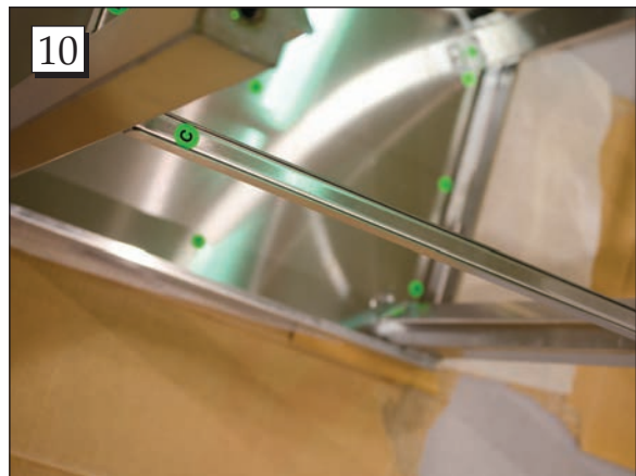
Step 10. Repeat steps 8-9 on the other long support bar marked "C".

Call Free: 1.800.848.1633 • Fax Free: 1.800.447.2923 Web: GoHCL.com • Email: hcl@GoHCL.com