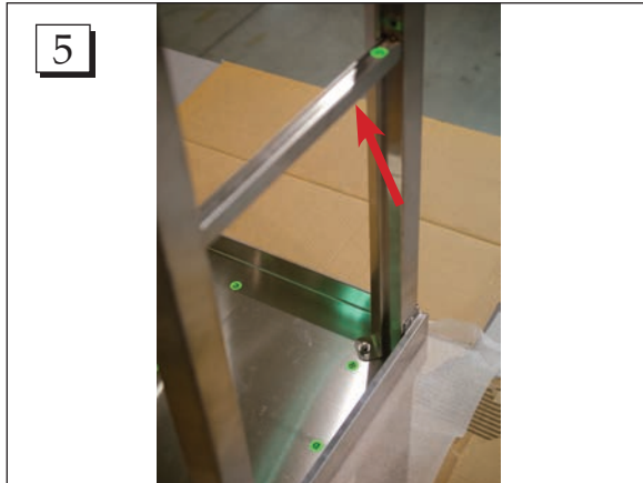
Step 5. Place the short support bars marked "D".