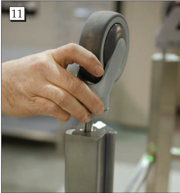
Step 11. Tighten the four casters into place.