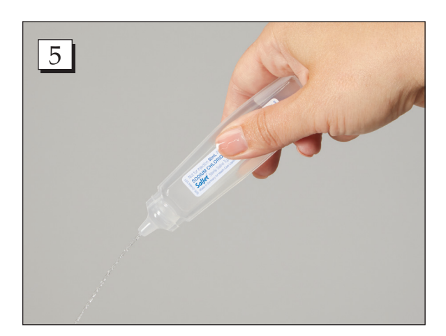
Step 5. The container may now be positioned at any angle required to access the area to be moistened or cleaned. Apply firm pressure to the container to obtain the desired flow rate.

Call Free: 1.800.848.1633 • Fax Free: 1.800.447.2923