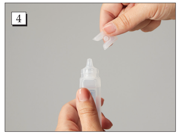
Step 4. After twisting the tab, pull on the tab to remove it from the top of the container.