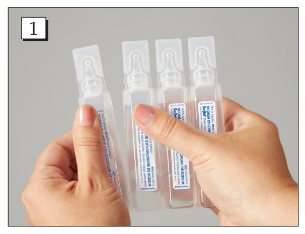
Step 1. Tear a single container from a strip of four.