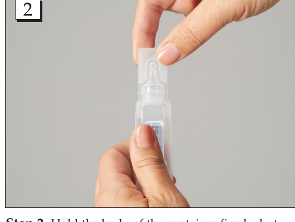
Step 2. Hold the body of the container firmly, but without squeezing, and grasp the tab between your thumb and fingers.