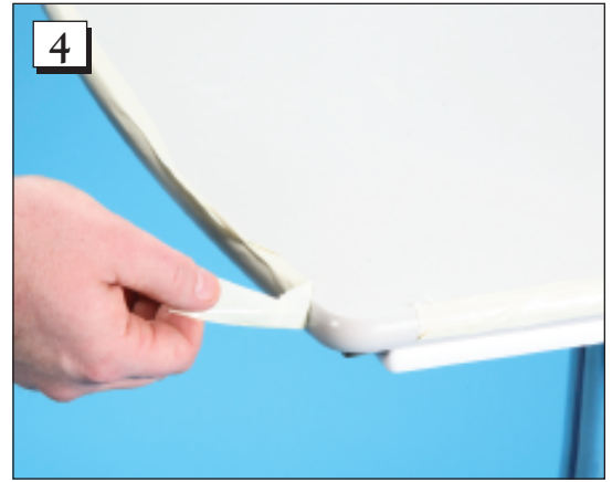
Step 4. Peel off protective edge film.