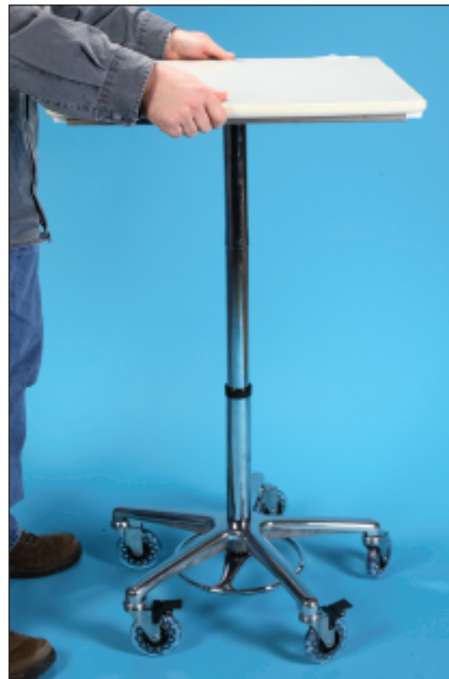
Step 6. Position the surface over the center column. The cord cap is in the back and the tapered edge is in the front. Use firm pressure to secure the surface to the column.