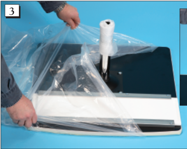
Step 3. Remove covering from workstation surface.