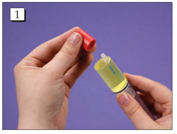
Step 1. Press cap onto the tip of the dispenser and press firmly until it clicks into place.