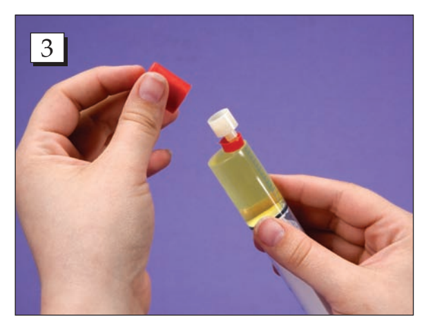
Step 3. The plastic sleeve is left behind when the cap is removed to indicate the syringe tip has been uncovered or tampering has occurred. Remove the white cap prior to use.