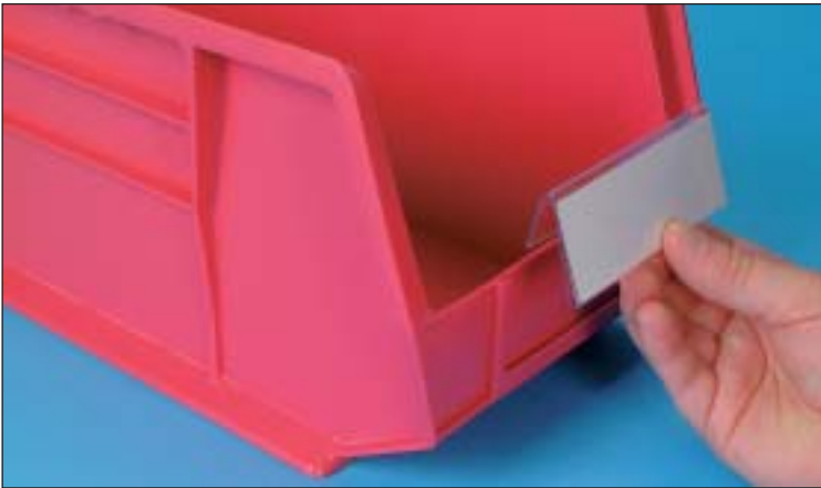
2. Slide the extension into the label slot on front of the bin.