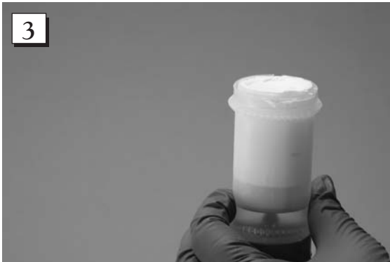
Step 3. While filling, stop at each \frac{1}{3} fill to tap the Topi-Click to help settle the topical ointment.