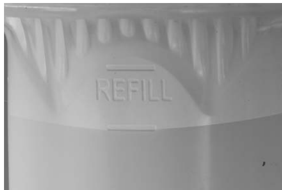
Note: When empty, color indicator will be at the "Refill" line.