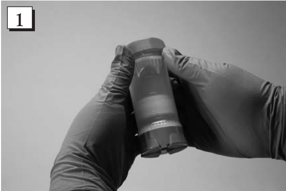
Step 1. Remove the cap.