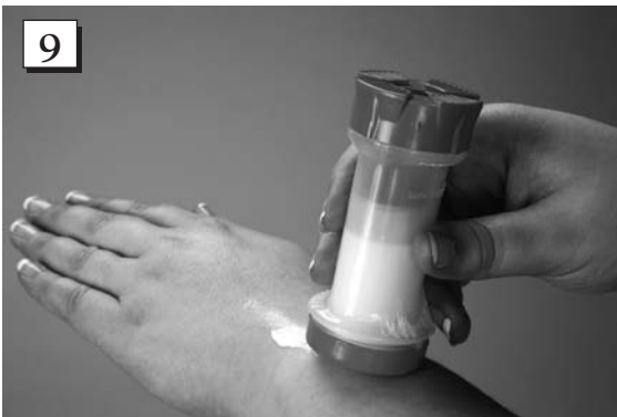
Step 9. Apply cream by rubbing applicator on the affected area of skin.