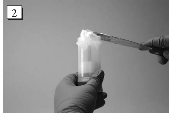
Step 2. Fill Topi-Click with desired topical ointment up to 33mL.