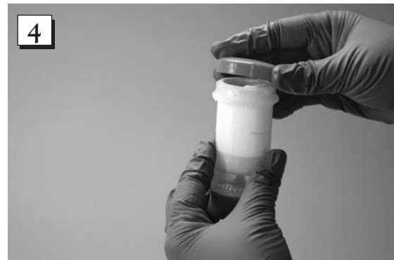
Step 4. Replace cap and press till the cap clicks on securely.