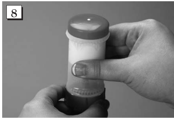
Step 8. Turn the base clockwise two clicks to dispense one dose.