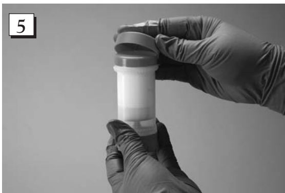
Step 5. Replace outer cap.