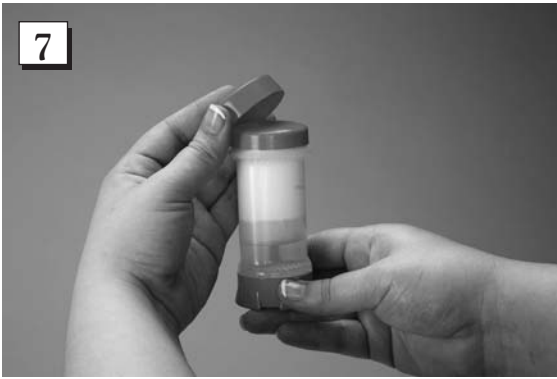
Step 7. For customer use, remove outer cap.