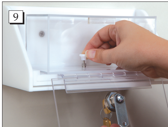
Step 9. Pull up of the white button in the middle of the locking box. While pulling up on the button, pull the entire box forward off of the Receiving Base.