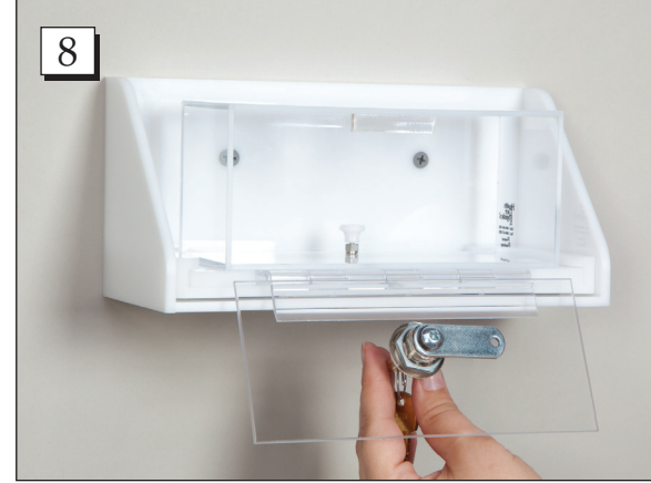
Step 8. Unlock the box.