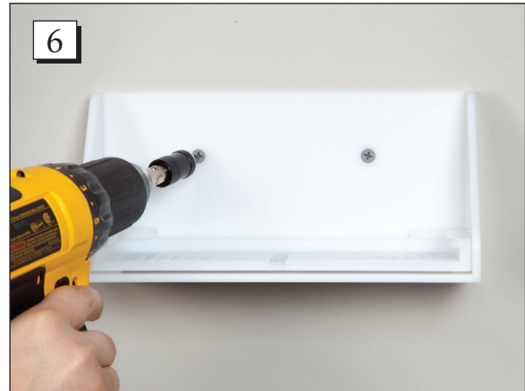
Step 6. Once level, tighten screws into the remaining holes.