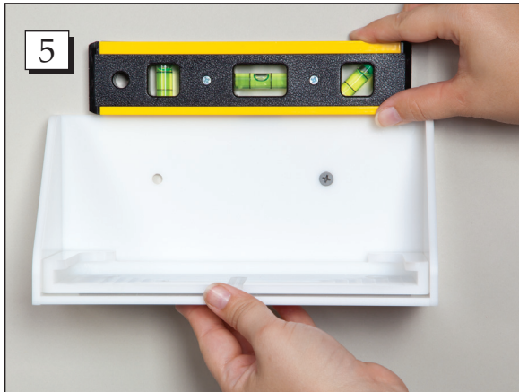
Step 5. Place a level on top of the Wall Mount.