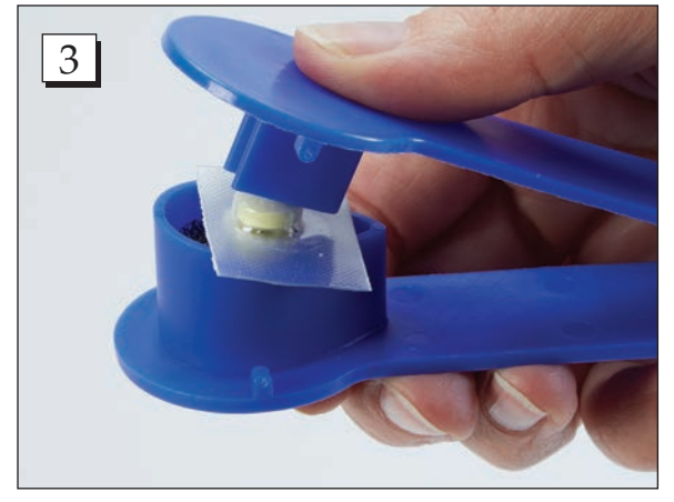
Step 3. Squeeze the tongs of the puncher together firmly to eject the tablet into the cup.