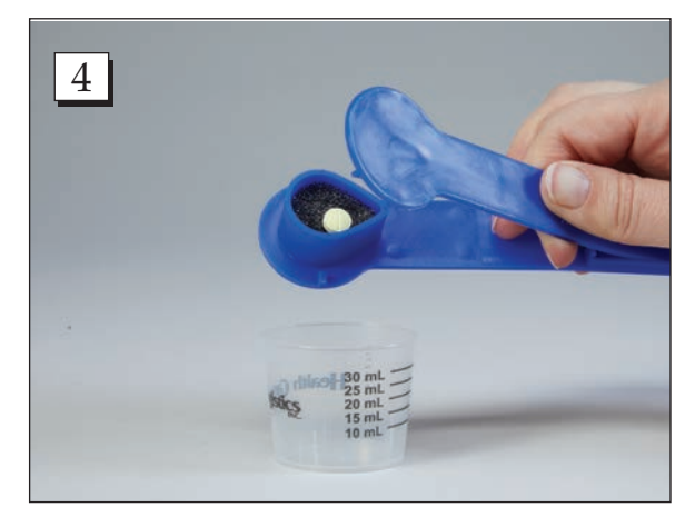
Step 4. Remove the empty blister and then empty the tablet from the cup into a med cup.