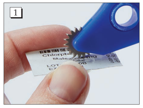
Step 1. For extra-tough blister backings, first perforate the backing using the wheel on the handle of the puncher.